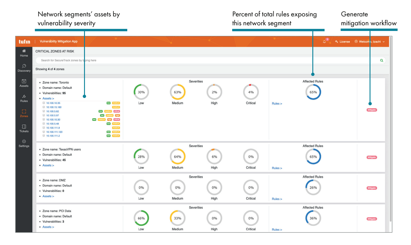
Prioritize security efforts based on your most vulnerable and critical network segments

The Tufin Vulnerability Mitigation app lets you view list of exposed vulnerable assets within the specified network segments and their vulnerability severity levels. You can also view the rules that enable access to and from a vulnerable asset, the underlying services exposing the vulnerabilities, and relevant firewalls that provide access. Through the vulnerability dashboard, you can track remediation and mitigation trends over time to help determine how your efforts are reducing your attack surface.